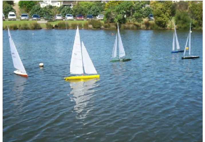
Brian leading the fleet with Grant keeping up in race 4.