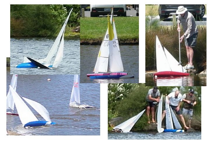
Ways of losing races in 2022