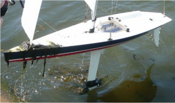
The wind was a very gusty and shifty south-west.

The weed was awful. We raked out large quantities but there was still much more. The high salt level is killing it off but the dead weed is floating up when the water temperature rises and causes gasification. Rafts of this then float out to the middle of the pond. It got worse with each race and racing was abandoned after 4 races.