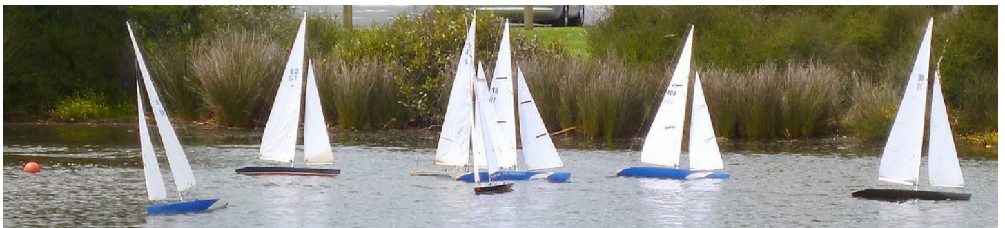
Several members sailed a few races before the AGM started.