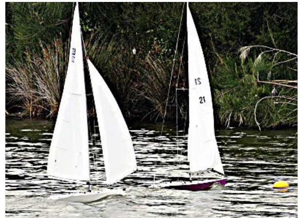
White boat (33) is on starboard, purple (21) is on port. 21 must keep clear.