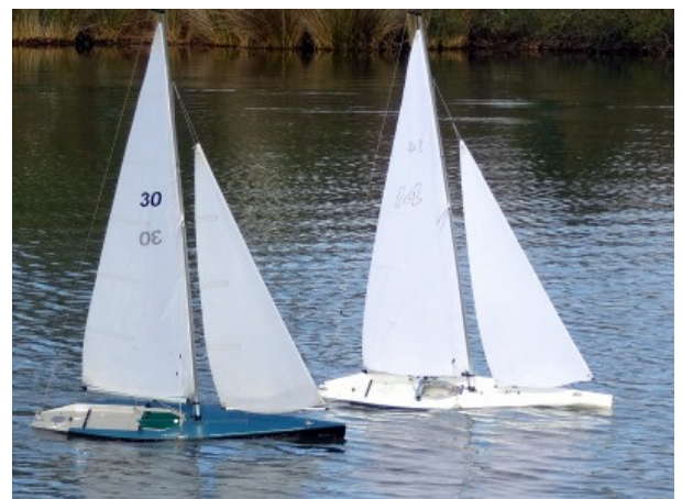
White boat (14) must keep clear of 30. If 30 has just established the overlap it must give 14 room to keep clear.